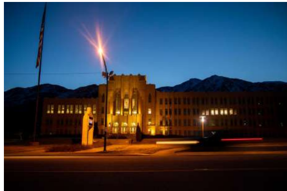
Ogden High School is seen at 6:40 A.M., 38 minutes before sunrise, on Tuesday, Feb. 18, 2020. If Utah were currently on year-round daylight saving time, as has been proposed in the Utah legislature, this is when Ogden High students would be arriving at school.

High school students, who face start times as early as 7:30 a.m. in Northern Utah, have long been traveling to school in the dark during the fall and winter. But year-round "forward" time would increase the length of the darkness in the morning and the number of days per year that students would be starting their studies in darkness or early twilight.